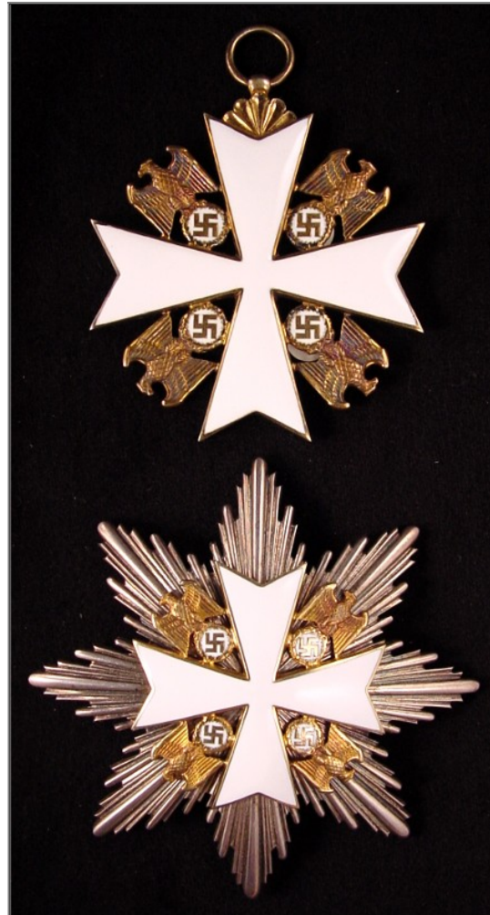
"Deutscher Adler Orden Grosskreuz" German Eagle Order Grand Cross

Check out those pretty pieces ( click on picture for an enlarged image ):