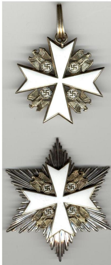
"Verdienstkreuz des Deutschen Adlerordens mit dem Stern" Merit Cross of the German Eagle Order with the Star This set was only awarded between May 1, 1937, until April 20, 1939. The so called 1st model is extremely rare. Both pieces are marked "800", the star also shows the punch mark "Silber"