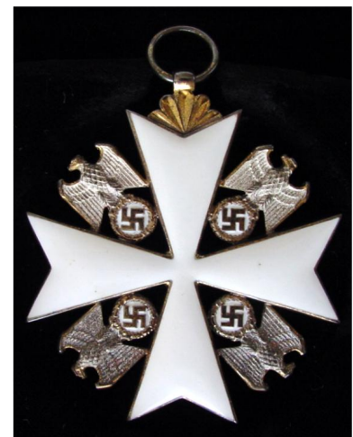
"Deutscher Adler Orden 1.Klasse" German Eagle Order 1st Class

Only awarded between December 27, 1943 to the end. The latest addition to the order is quite rare. The Eagles are silver with a golden rim on cross and star, despite to being completely gilt as on all other grades. The star shows the marks "900 21" on its needle.